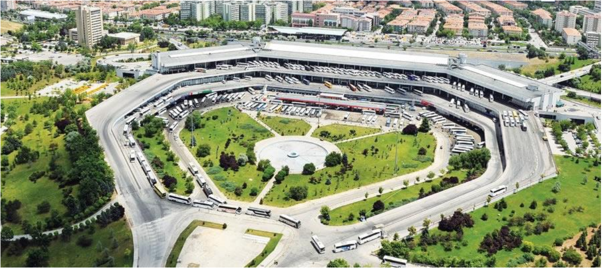
AŐTİ THE INTERCITY BUS TERMINAL